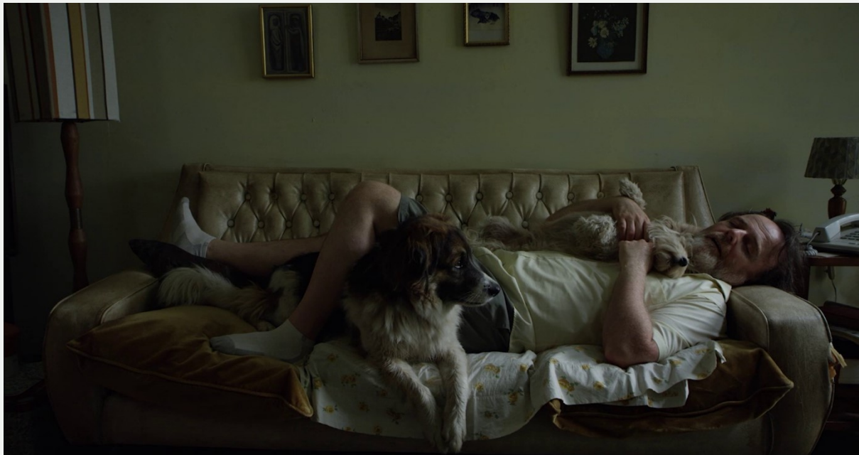
Still from ' Seven Dogs '