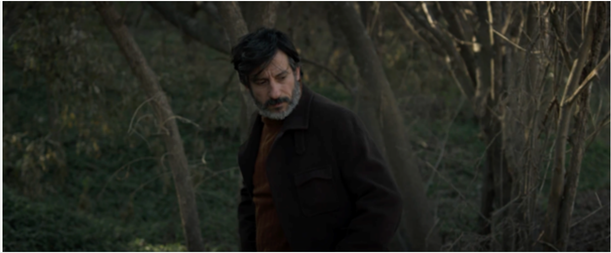
Still from 'Self Defence'

Other films of Argentinian origin that will be screened in the festival are Miss Viborg (2022), The borders of Time (2021), The Substitute (2022), Robe of Gems (2022) and Eami (2022).