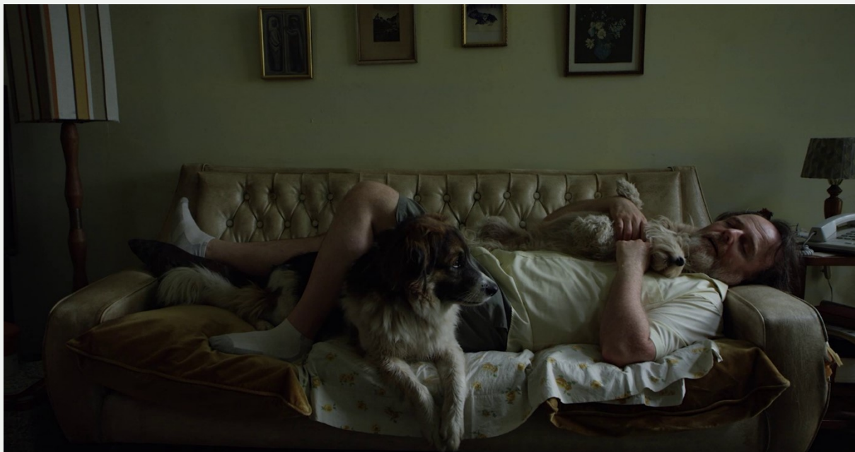
Still from ' Seven Dogs '