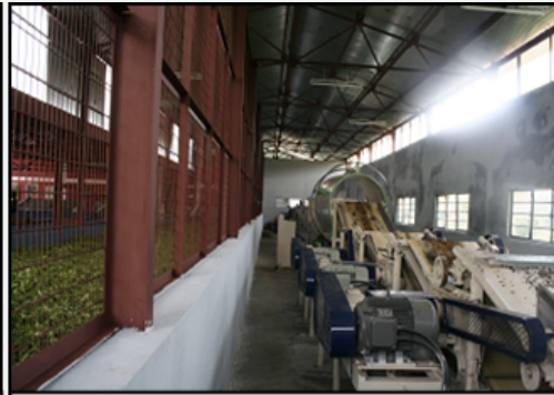
Tea Factory at Rongram, West Garo Hills, Meghalaya