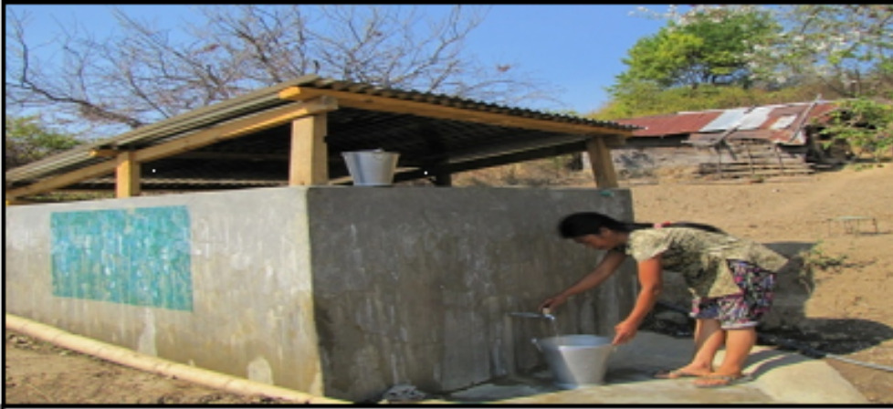
Drinking Water Supply at West Khasi Hills Meghalaya