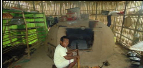
Bakery Unit in West Garo Hills, Meghalaya