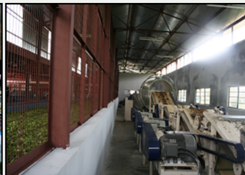
Tea Factory at Rongram, West Garo Hills, Meghalaya