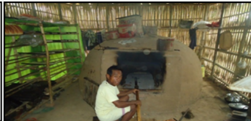
Bakery Unit in West Garo Hills, Meghalaya