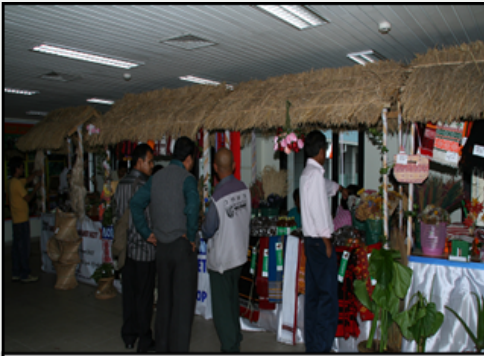
NEAT Fest 2019 at Shillong, Meghalaya for showcasing and promoting Community Products