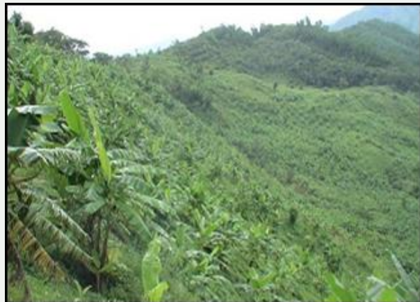
Banana Plantation in Nungou village Ukhrul, Manipur