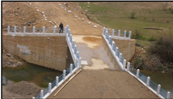
Seipei Kong Bridge at Nungshong Khullen Ukhrul, Manipur