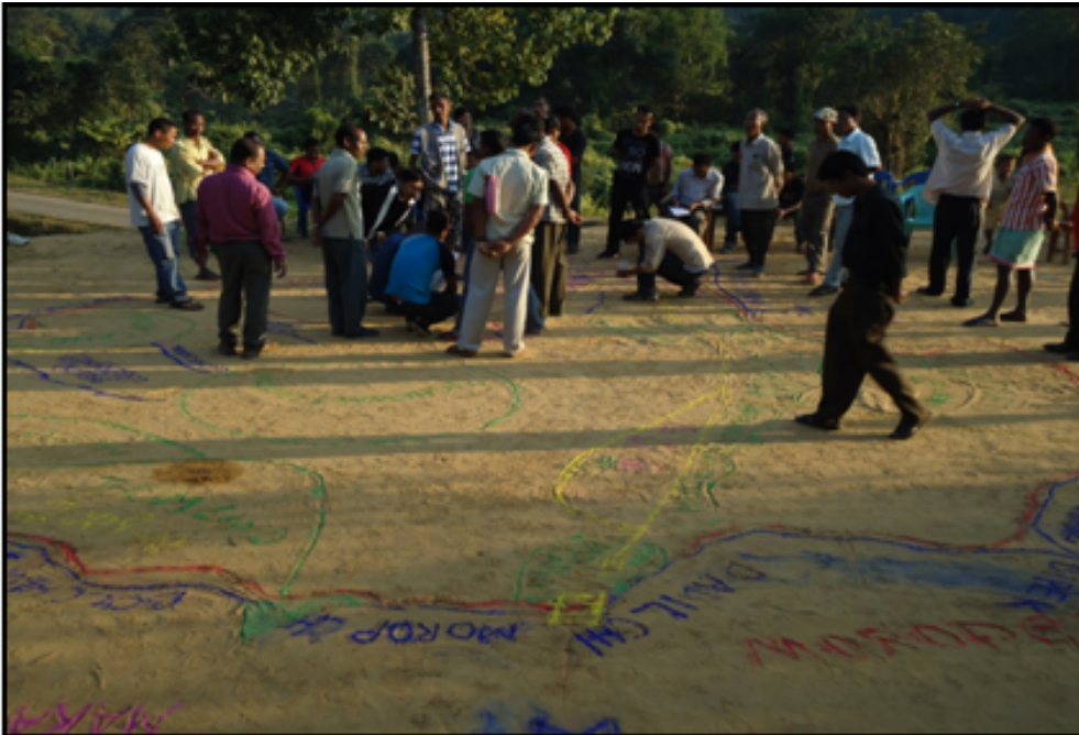
PRA Exercise at West Garo Hills, Meghalaya