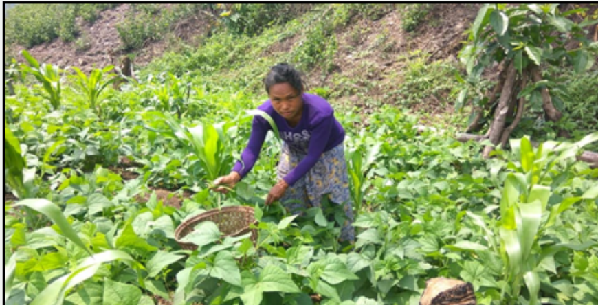
Vegetable Cultivation in Tirap, Arunachal Pradesh

this component was to provide communities access to safe drinking water and improved sanitation.