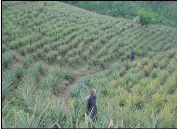
Pineapple Plantation in Phungkilhar village Ukhrul, Manipur