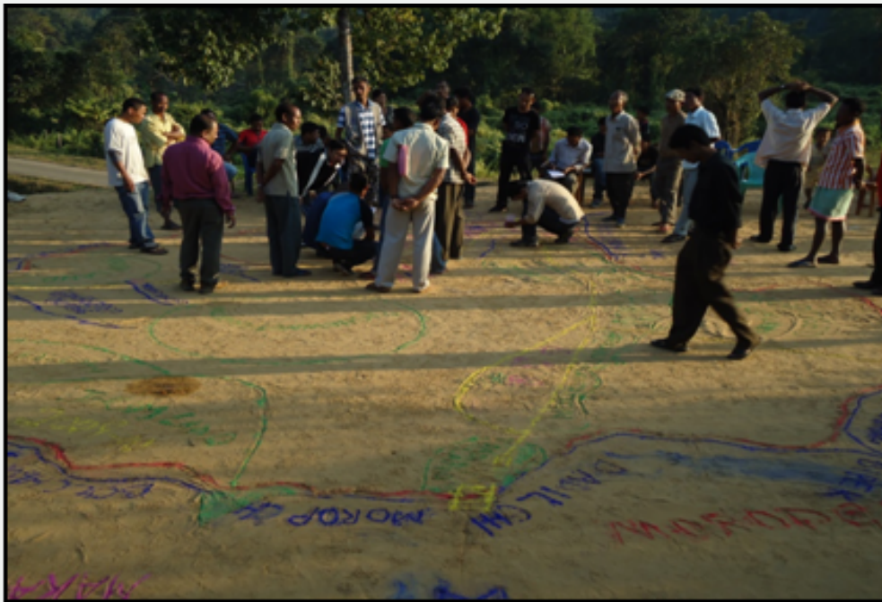
PRA Exercise at West Garo Hills, Meghalaya