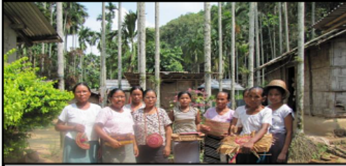
Water Hyacinth Craft Products developed by SHGs West Garo Hills, Meghalaya