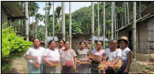
Water Hyacinth Craft Products developed by SHGs West Garo Hills, Meghalaya