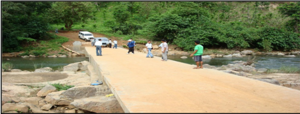
Causeway Bridge constructed through convergence in West Garo Hills, Meghalaya

v) Community-based Bio-diversity Conservation & Communication: The specific objective is to protect and preserve the unique natural resources and rich bio-diversity of the region. The sub-components to achieve this objective were: (i) bio-diversity conservation and research aimed at promoting community conserved areas (CCAs) as sacred groves,