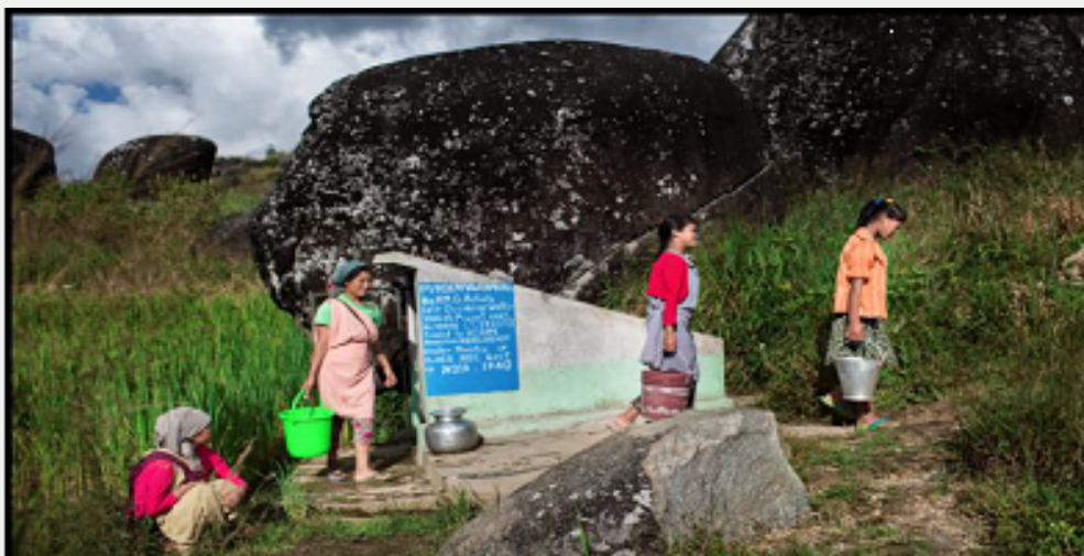
Drinking Water Supply at Ukhrul, Manipur