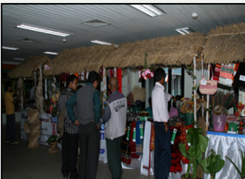
NEAT Fest 2019 at Shillong, Meghalaya for showcasing and promoting Community Products