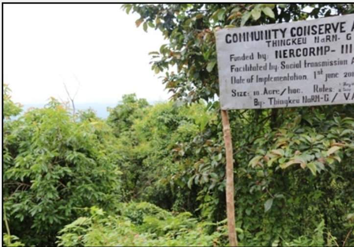
Community Conserve Area (CCA) of Thingkeu NaRM-G in Churachandpur, Manipur

(iii) communication and knowledge management to facilitate information and knowledge sharing on good practices and production systems between communities.