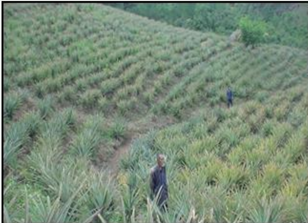
Pineapple Plantation in Phungkilkar village Ukhrul, Manipur