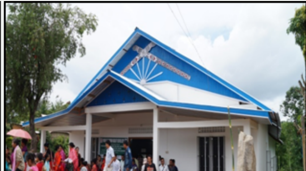
CHC in Riha Village, Ukhrul Manipur