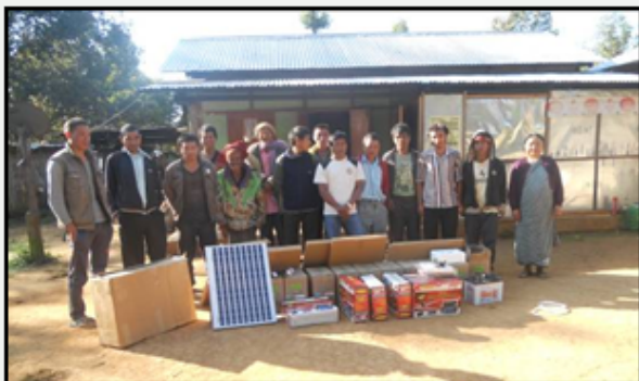
Home Solar Unit, Dima Hasao, Assam