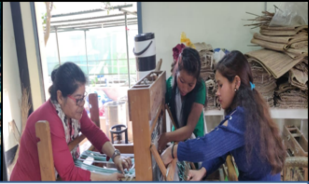
Large Cardamom Fibre Craft (Initiative to convert waste into wealth) at Tirap, Arunachal Pradesh