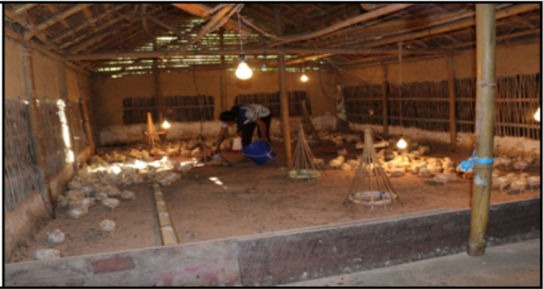
Poultry Unit at New Ningthiching Churachandpur, Manipur