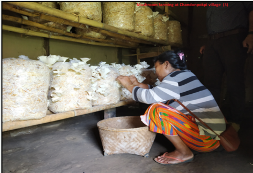
Mushroom Cultivation at Chandrapokpi village, Chandel Manipur