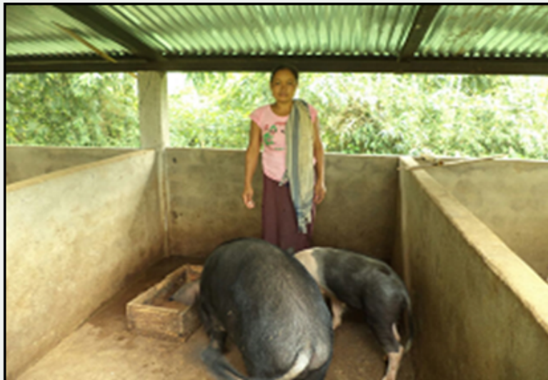
Piggery Unit in Nomjang village Dima Hasao, Assam