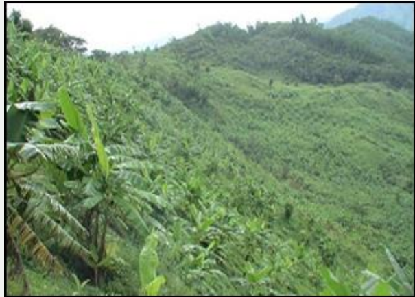
Banana Plantation in Nungoum village Ukhrul, Manipur