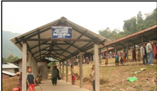
Market & Collection Shed, Dima Hasao, Assam