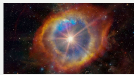
Fig 1: A typical cartoon explaining a supernova explosion (acknowledgment for the figure https://www.ecomagazine.com/news/science/cosmic-energy-from-supernovae-may-have-wiped-out-large-ocean-animals-study-suggests ).

Comparing the line velocities as obtained using spectral modeling, the scientists showed that SN 2010kd exploded with a larger velocity but decayed slower than other similar supernovae. The ejected mass of the Oxygen and estimated values of luminosity of other spectral lines was also found to be higher for SN 2010kd.